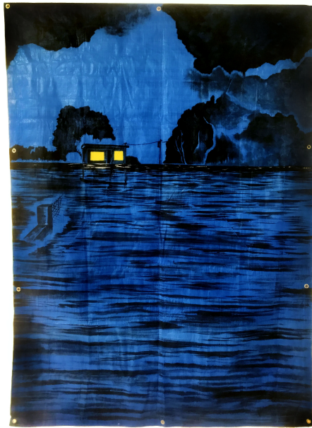
Flood Aftermath and Other Hurricane Stories I , 2015, Enamel paint, polyethylene, blue tarp. © Lionel Cruet.