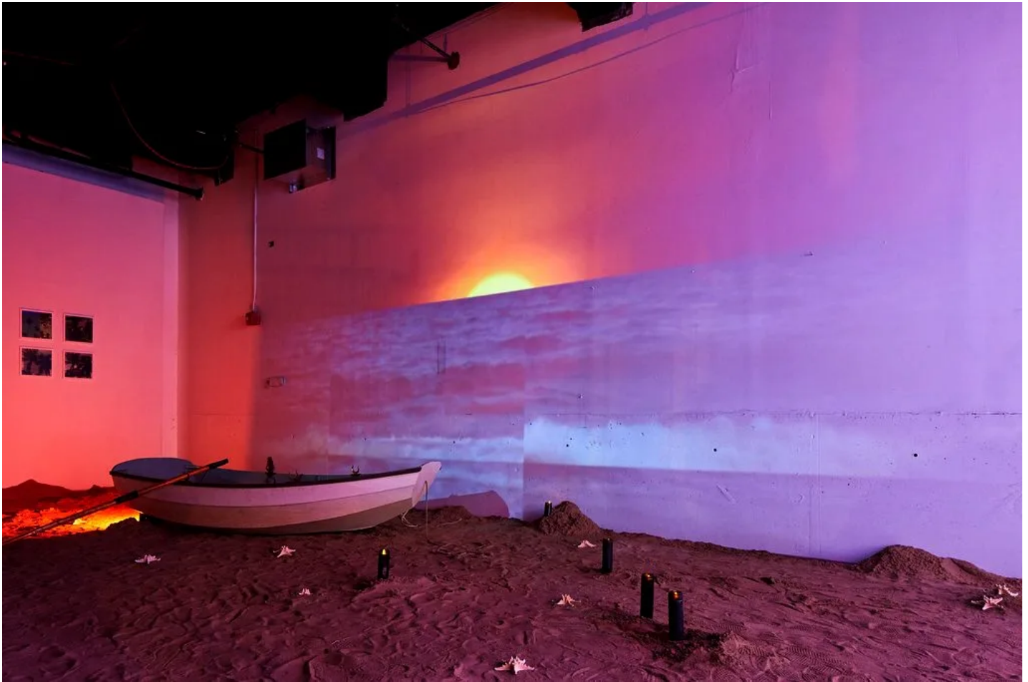
Entre Nosotros (Between Us) , 2017, full view, audiovisual installation row boat, floor of sand, variable dimension © Lionel Cruet. Photo by Samuel Morgan Photography.

Lionel Cruet conceives of his art as an iterative practice. Each project builds on the former, as if chapters recording the text of his experience. His 2017 installation Entre Nosotros (Between Us) came in two distinct iterations; the first was presented at the Lincoln Square Neighborhood Center in New York, the second ( Entre Nosotros II ) at BKLYN IMMERSIVE (curated by Sofia Reeser del Rio) under the auspices of the SPRING/BREAK Art Show. Both combined different parts of his practice such as video projections, sounds, lights, and found objects into immersive audiovisual installations. Real objects, such as hammocks, a boat, or real sand were included along with digital representations of a sunset or the ocean to seemingly transport the viewer to an imagined beach landscape. Entre Nosotros I and II both locate the viewer in the place at the boundary of land and sea, while they are physically located in a gallery space.