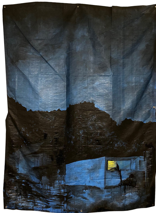
Flood Aftermath and Other Hurricane Stories V , 2020, Enamel paint, polyethylene, blue tarp. © Lionel Cruet.

In Flood Aftermath and Other Hurricane Stories (2015-2020), Cruet produced poignant paintings, which point both to the ecological devastation of climate change, and to how the economic, and political legacies of colonialism affect the modern Caribbean. The blue tarps, which serve as the ground for these paintings, reference their use as temporary solutions to damage from hurricanes, and also their eventual architectural permanence in those communities most affected. At the same time, the paintings literally depict scenes of flooding in Caribbean locales. This layering of meaning through the careful choice of material and subject matter is essential to Cruet's work. For Lionel Cruet, an artwork containing multiple, reinforcing meanings is not unusual. As we move into a new era defined by a rapidly changing climate, Cruet's work will provide one lens to understand new geopolitical realities and new projects will continue. Don't be surprised to come across Cruet's works and feel more in an overlapped place that appears to the real as well the imagined. •